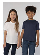
SOL'S REGENT KIDS 11970